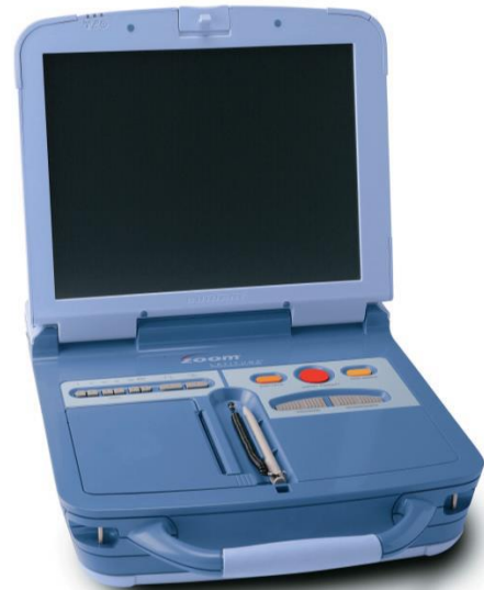
Figure 1. Model 3120 ZOOM Programmer